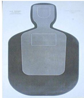
Figure 1 NRA TQ-19 Target